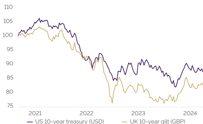
UK Gilt and US 10-year treasury bond total return indices

Source: LSEG Datastream/Evelyn Partners, data as at 04 April 2024