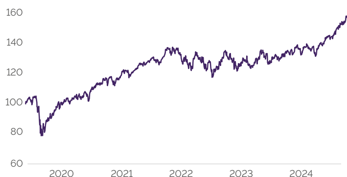
Global equity index (GBP, TR)